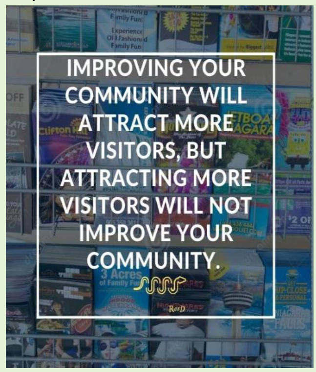
Build a town where the locals want to come to, the tourists will find it!

We love to have company! Tourism is very important to us and to KY. We also must have a community that the locals love and share. Main Streets strive to build communities where people want to work, shop, play, invest & relocate their families and or business. You can volunteer to be a part of the great work being done across the state by finding a KYMS community near you.!