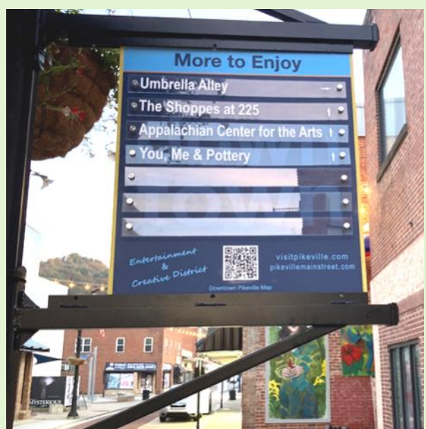
Great wayfinding signage in Pikeville's Entertainment and Creative District! Transforming Second Street!